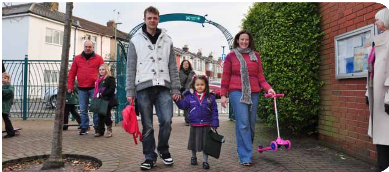
Gathering parents' views electronically can save time and save the environment.

If a school has any concerns, the headteacher/principal or the appropriate authority should contact enquiries@ofsted.gov.uk